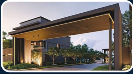
Grand Entrance Arch